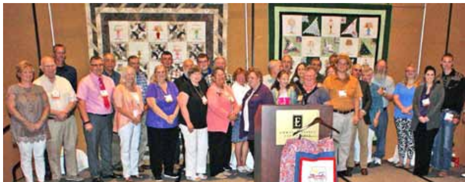
Knights of The Roundtable 2018