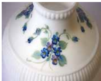
Petite Violets Shade

Limited Edition, Signature Series, 2018 Grand Vertique