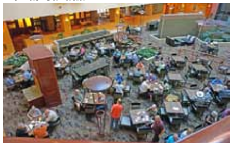
Main floor Embassy East Peoria, Illinois.

We ended with 269 registered attendees, 29 States were represented as well as Canada.