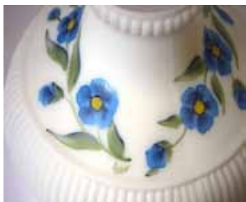
Blue Cosmos Shade.